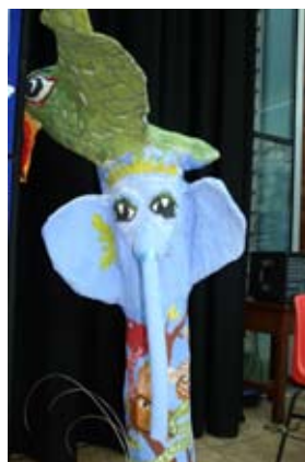
Some of the wonderful displays on offer in Cork