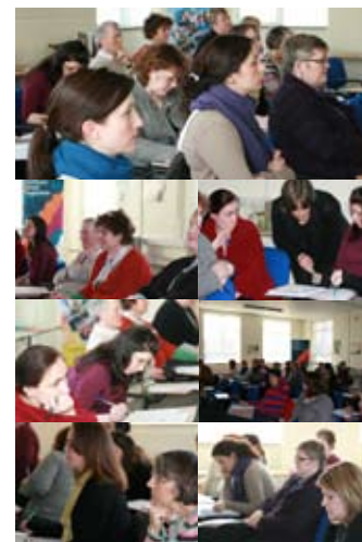
JCSP Co-ordinators and Librarians at the Meeting in CDU