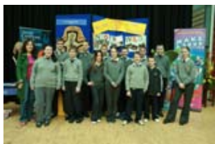
Students enjoying the many wonderful exhibits in Cork.