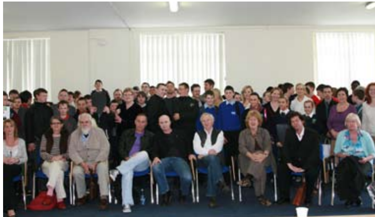
A group photo of all writers, students, teachers, librarians and members of the JCSP Support Team at the end of a great day

The JCSP Library Project and Poetry Ireland would like to compliment all participant schools on the success of the day. The day ran extremely smoothly with absolutely no hiccups of any sort. All the students present were a credit to their schools on the day.