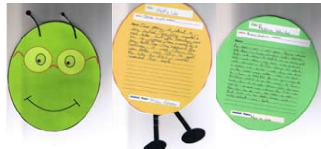
Students write up their book reviews onto the caterpillar shape which are then displayed around the wall.