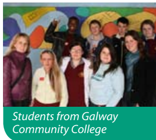
Students from Galway Community College