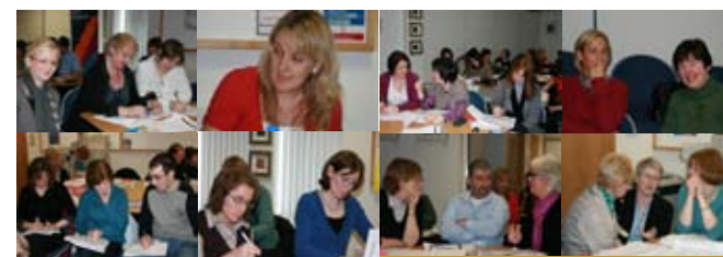
Co-ordinators, Librarians and JCSP Support Team Members busy working away in Drumcondra Education Centre