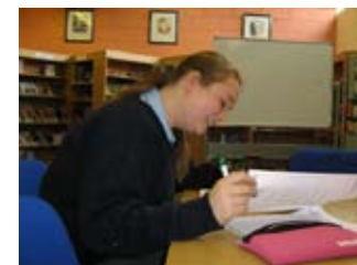
Students working away on their Literacy and Numeracy

The routine of being in the library every day is much closer to the students' primary school experience and thus it has helped smooth their transition from primary to post-primary education. The students are much more settled and the effect on their behaviour is felt throughout the school day. The high staff numbers and team teaching approach allow us to give individual attention to students when it is required. They also allow us to deal with discipline issues before they become serious as well as identify any difficulties of a personal or social nature a student might have.