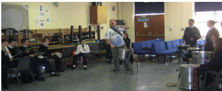
Students involved in the Samba Initiative

Some of the Initiatives completed in the College involved a Celebrity Chef visit, a trip to Carlingford Adventure Centre, Science and Green School gardening, a Ceilí Mór, Samba Sessions and Italian simulation of cooking and shopping.