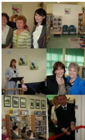
Some of the staff and invited guests at the launch