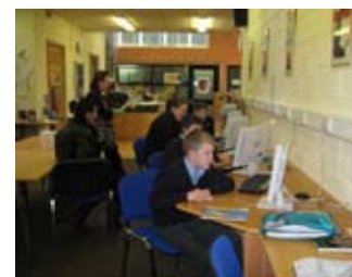
Students work individually, in pairs or in groups with support from teachers and Special Needs Assistants