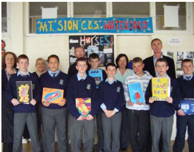
Proud authors from Mount Sion display their books

The display of photographs from their field trip and the students' artwork also attracted much admiration and praise from teachers, parents and guests alike. Certificates were awarded to all students in recognition of their achievements during the year.