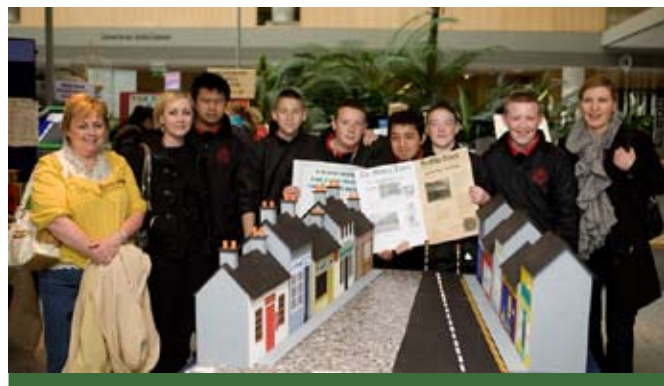
Students from O'Faich College, Dundalk with their book at the Dublin exhibit