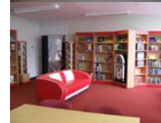
Before and After!