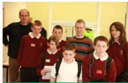
Students from Abbey Community College

"I'd love to be a writer.....I could make stories all day"